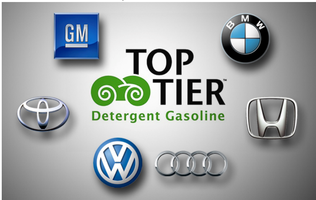
Figure 3: Top Tier gasoline logo

All gasoline retailers can apply for Top Tier status, “Once a fuel marketer has submitted their performance testing results, the data is reviewed by all of the automotive sponsors against the performance specification limits and is either a Pass or a Fail. If a Pass, the fuel marketer will be given a TOP TIER license agreement” (Toptiergas.com). Several gasoline brands advertise their special additive packages as an effective method of boosting vehicle power and efficiency while cleanings and maintaining engine parts: