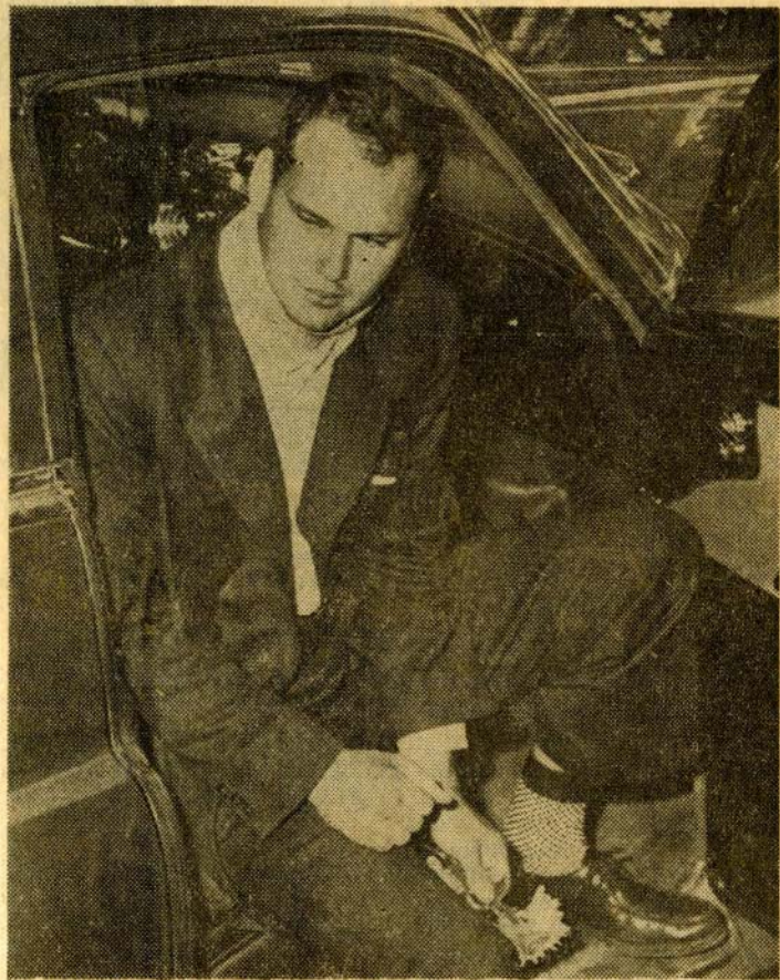
SHEPPARD AFTER QUESTIONING. Dr. Samuel H. Sheppard sat in a car and toyed with flowers after visiting his house where his wife was slain.