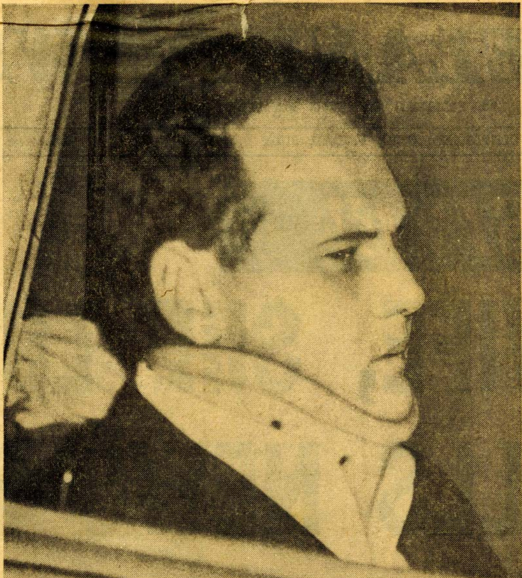
Dr. Samuel H. Sheppard who gave an exclusive interview to The News today.