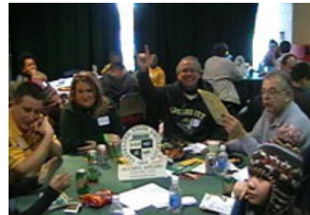
Butler Tailgate Party 2010

Save the Date! Join us for an exciting tailgate party on Saturday February 5th, as our CSU Men's Basketball team gets ready to play NCAA finalist Butler. The party starts at 11:30 a.m. and the game begins at 2:00 p.m. For only $20, come enjoy great food & drinks, and get to know Nance alumni, faculty, staff and students; the cost of the game ticket is included. Current CSU students get into the game free with your CSU ID and pay only $12 for the party.