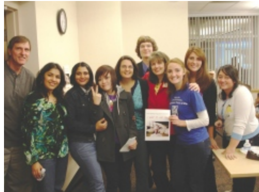
Members of the SAVE organization.

Thanks to the student organization called Student Advocates for a Vegetarian Ethic (SAVE), a number of turkeys were spared during the last Thanksgiving holiday. They recently hosted a "Vegetarian Thanksgiving Feast" on November 12th which was a huge success judging by the number of students who turned up, coupled with their feedback of the event. A non-vegetarian student who attended the feast said, "I was quite impressed by the wide array of food that was offered, and everything tasted really good". Over 150 students gathered in the student center ballroom and were treated with lots of vegetarian dishes, a live DJ, a stand-up comic, and many chances to win prizes through a raffle.