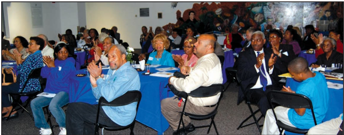
Audience members at the October 2007 Wings Over Jordan 70 th Anniversary kick-off.