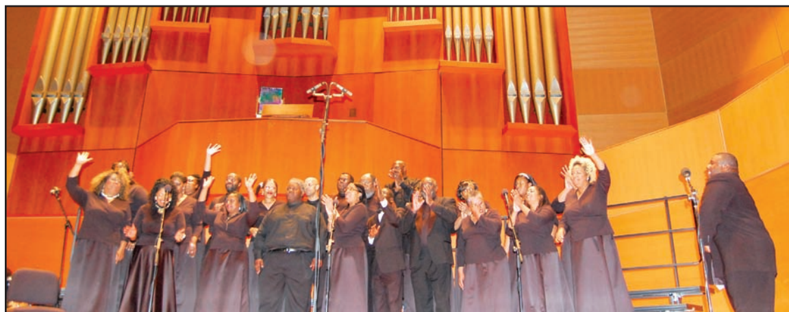
The Spiritual Gifts Ensemble performs its grand finale on April 26, 2009.