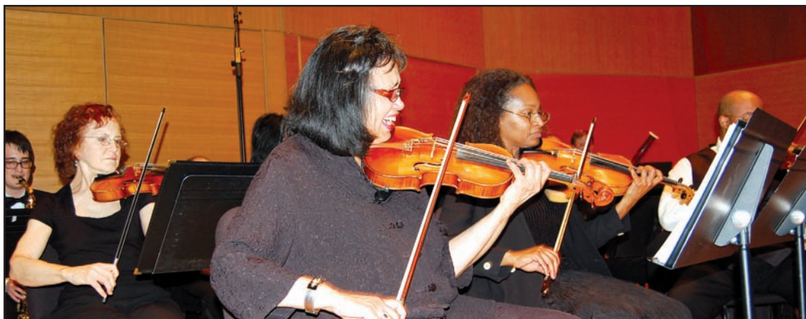
The violin section of The Melting Pot Orchestra, which accompanied the Spiritual Gifts Ensemble during its April 26, 2009 concert performance at Cleveland State University.