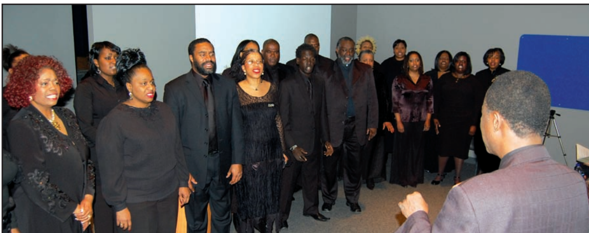
The Spiritual Gifts Ensemble at the Western Reserve Historical Society in January 2009.