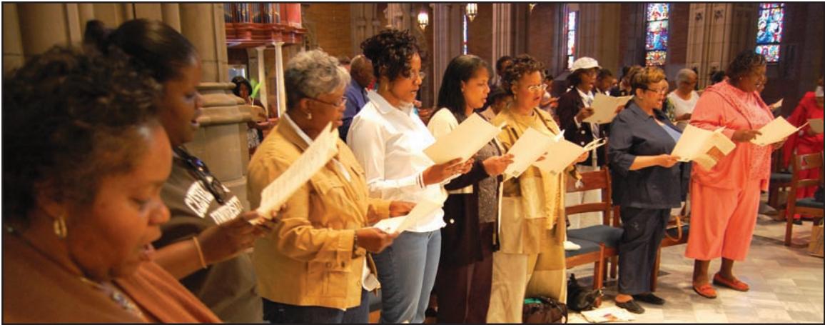
Female vocalists at the Abbington workshop.