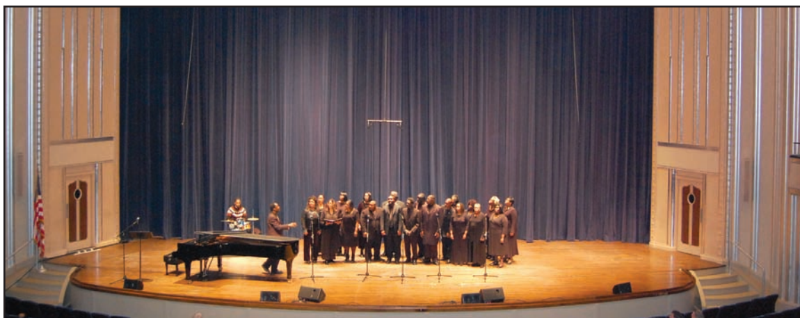
The Spiritual Gifts Ensemble on the stage of Severance Hall, home of the Cleveland Symphony Orchestra, in January 2009.