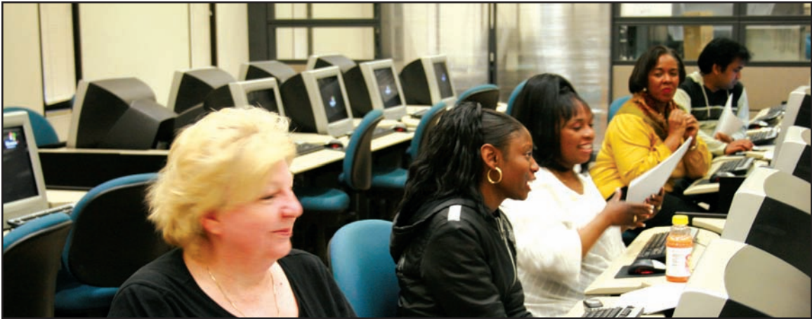
In the summer of 2008, the students worked with library staff members to launch Praying Grounds online archive.