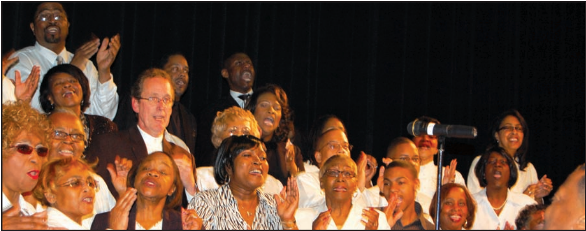
The Greater Cleveland Choral Chapter of the National Convention of Gospel Choirs and Choruses performed during the April 2009 Religious History and Sacred Music Institute. Thomas Andrew Dorsey, “The Father of Gospel Music,” founded the parent body in 1932.