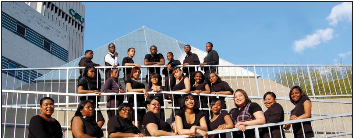
Student singers strike a pose outside CSU's Music and Communication Building following their performance for the May 1, 2009 Wings Over Jordan Choral Music Workshop.