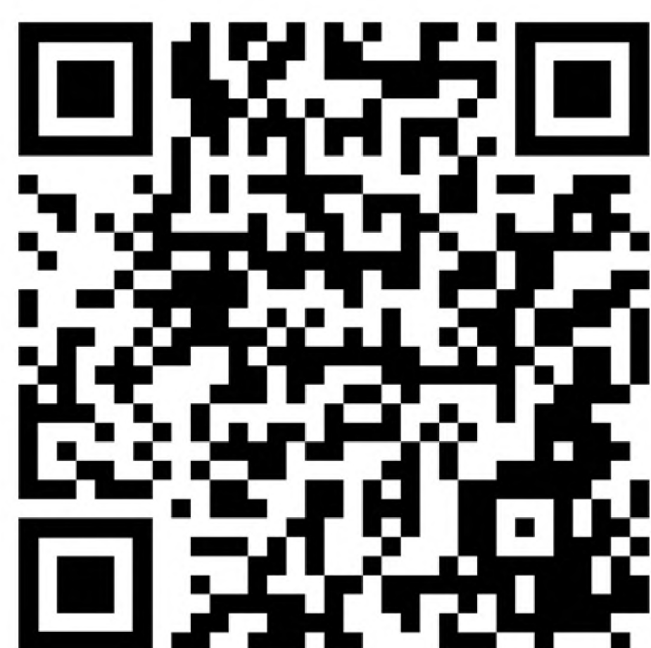
Capstone Video Presentation

I have experience working with a variety of ages and diagnoses throughout my fieldwork and capstone experiences. I am passionate about working with children with developmental disabilities in the school, home and clinical settings. I strive to make therapy fun, engaging, and personalized to each individual to maximize motivation to learn new skills. I want to continue to advocate for occupational justice.