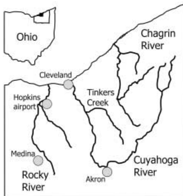
FIG. 1. Location of the Cuyahoga and Rocky Rivers, which flow into Lake Erie in northeast Ohio.

Mussels were collected from a variety of sites (Fig. 1) within the Cuyahoga River and Rocky