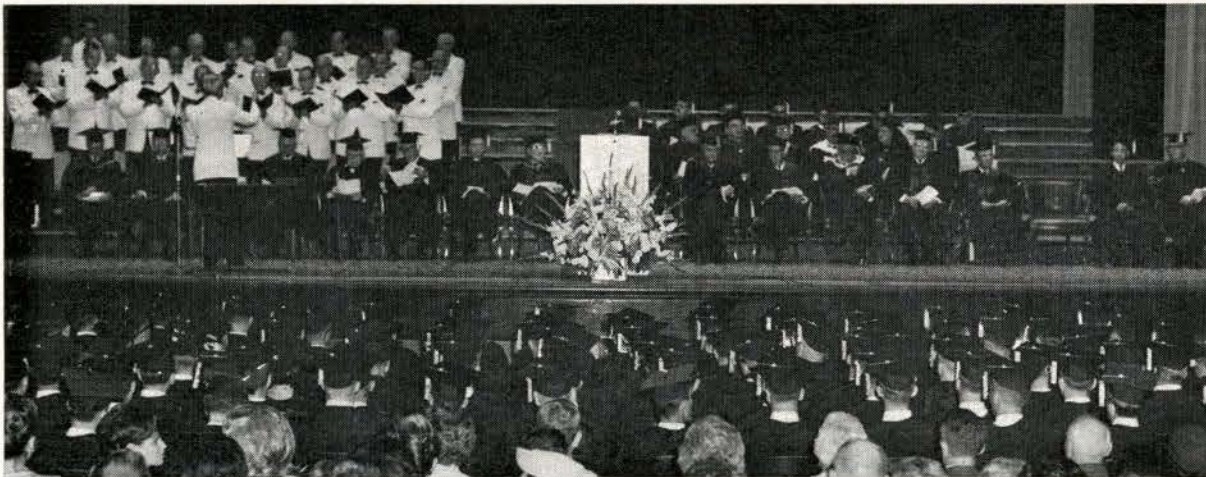
White-jacketed singers of The Cleveland Male Chorus provided the music for Cleveland-Marshall Law School's 66th Annual Commencement at the Music Hall, June 11, 1965. Seated on the platform are members of the administration and faculty of the law school, and recipients of honorary degrees. In the front rows in the audience is the graduating class, waiting to receive their degrees and to have the cowles, with the law school's colors of brown and gold, placed on their shoulders.