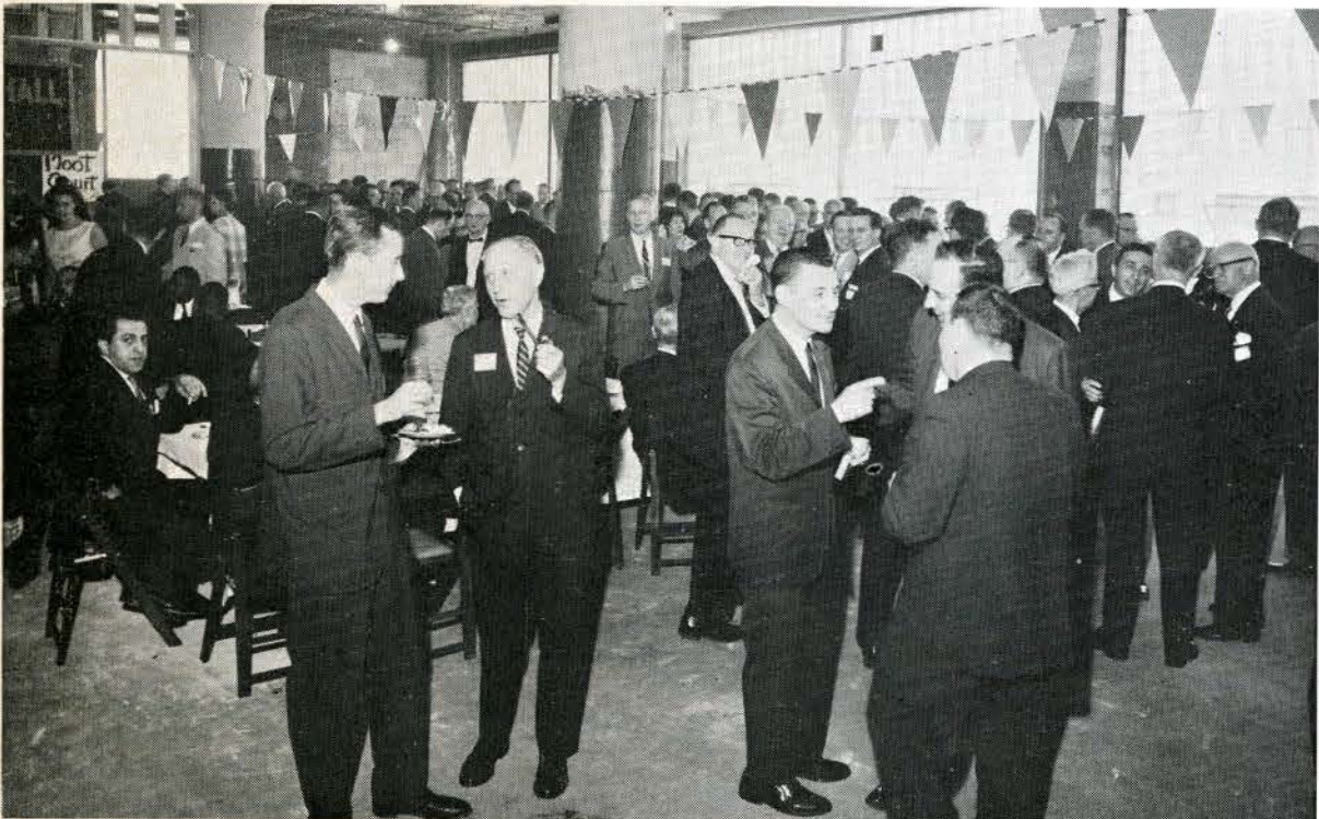
More than 400 alumni gathered for the Alumni Association's Annual Open House, held June 10 on the school's first floor in the space formerly occupied by the Daily Legal News. The area visible in the photo has been renovated and now consists of two classrooms and a Moot Court, divided by folding partitions, so that we can meet in the same spot again next year! Cheers!