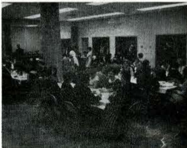
Students enjoy dinner at Annual Awards Dinner-Dance.