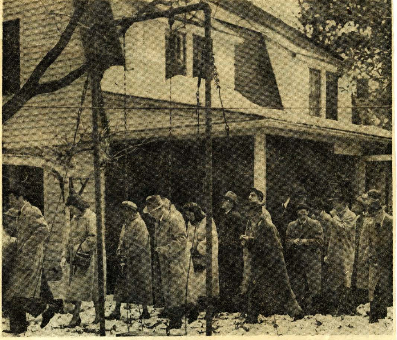
Jury as it visited the Sheppard home