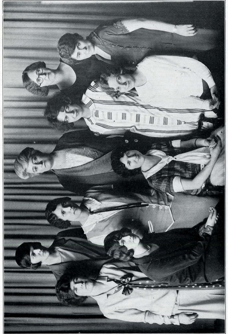
Kappa Beta Phi Legal Sorority