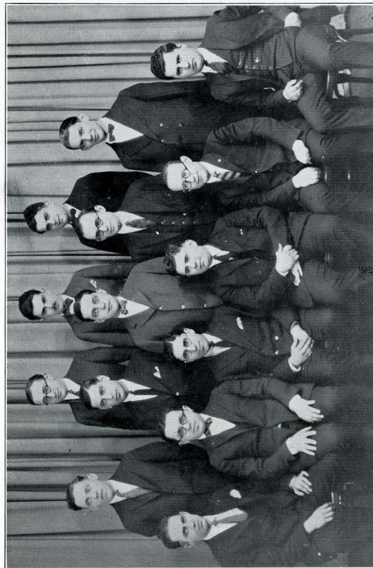
A Group of Lamdas