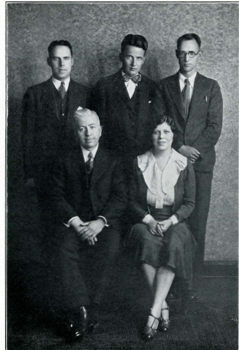
"JOHN MARSHALL FORUM TRUSTEES"