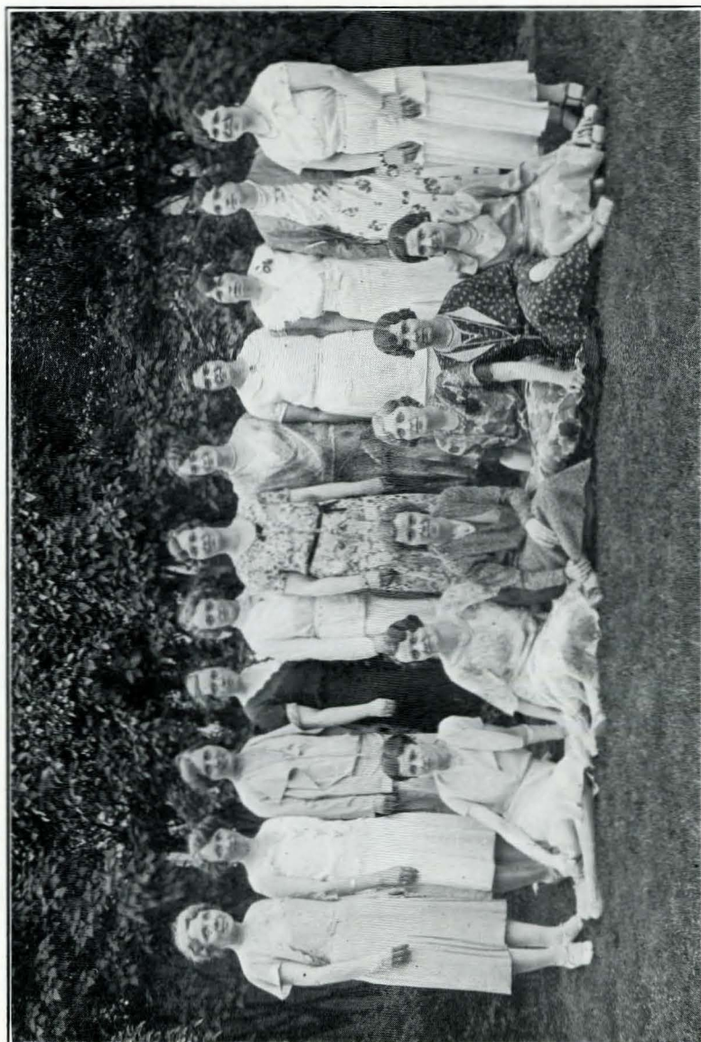
"KAPPA BETA PI SORORITY"