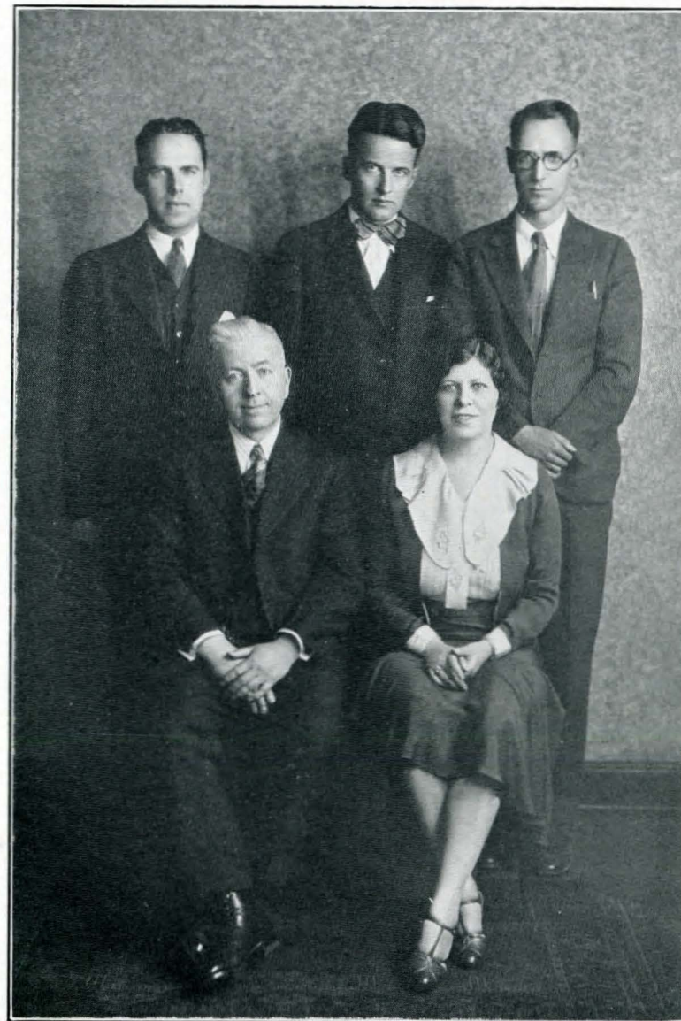
"JOHN MARSHALL FORUM TRUSTEES"

Forum activities are conducted under the guidance of five Trustees, four of whom are elected from the student body, and one from the faculty.