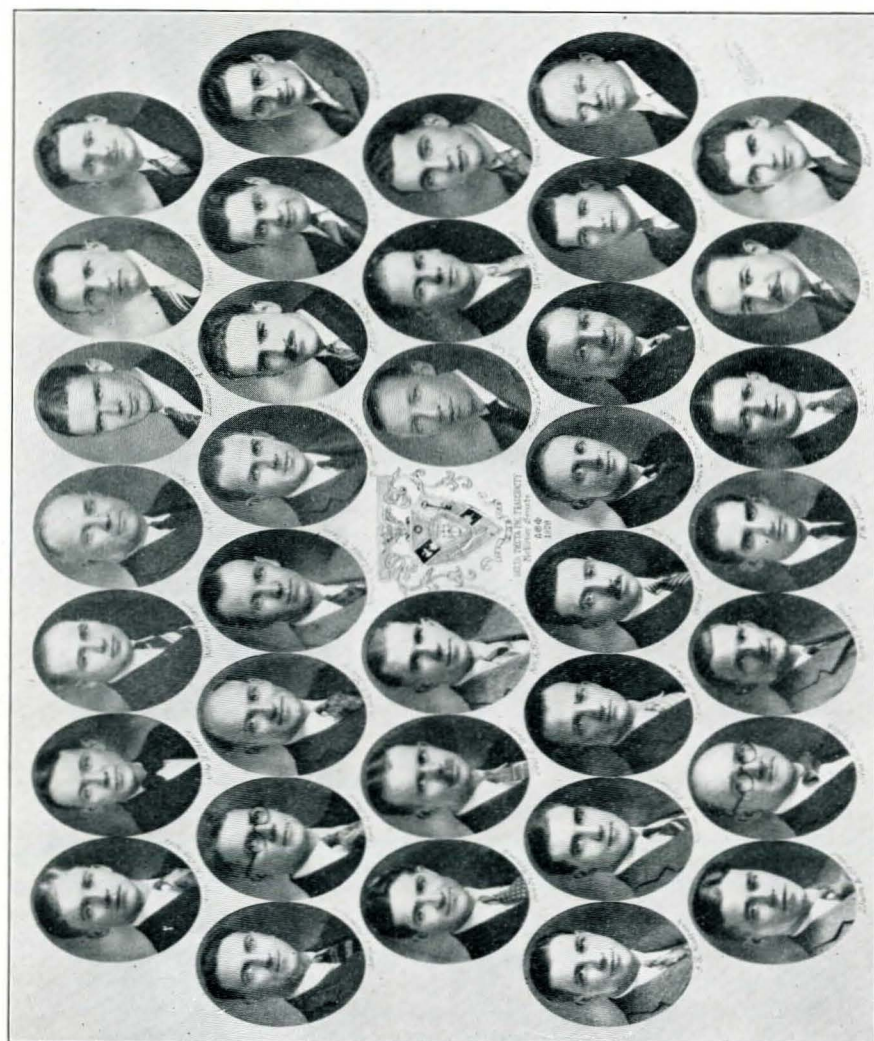
McKINLEY SENATE—DELTA THETA PHI LAW FRATERNITY