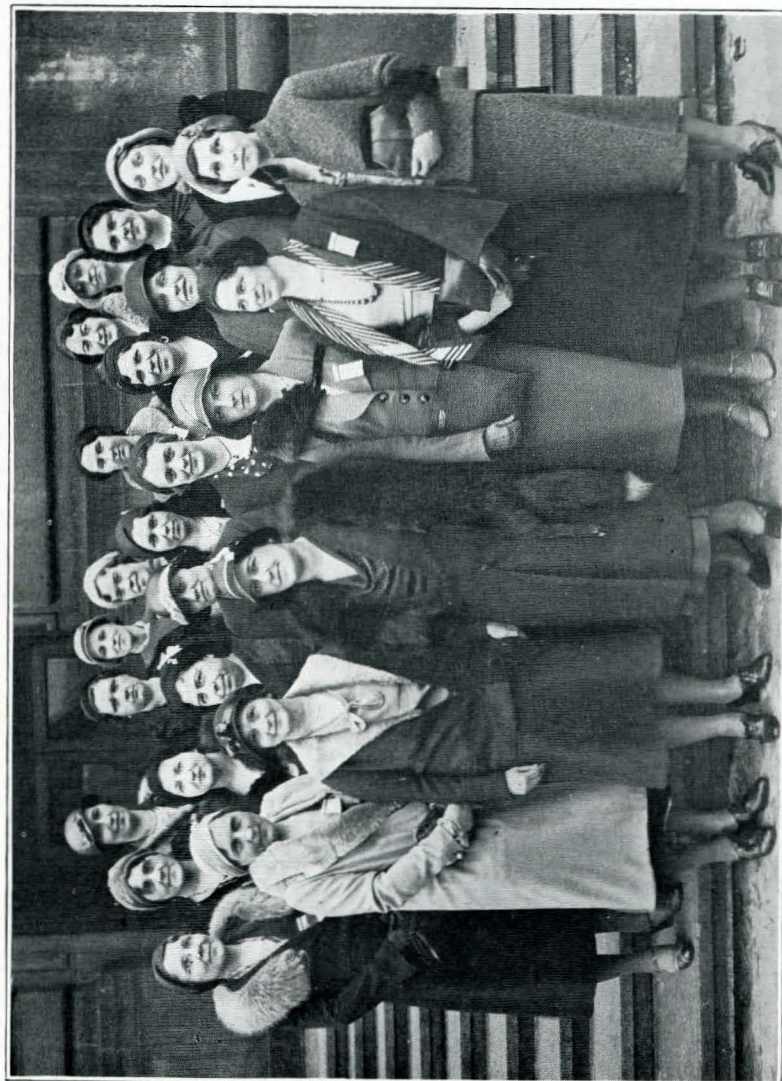
"KAPPA BETA PI SORORITY"