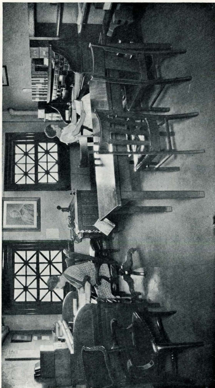
LAW SCHOOL OFFICE

Many of them have chosen the profession and have almost invariably been successful. You will find them on the bench and leaders of the bar. At the present time thirteen out of sixteen of the presiding judges in the Municipal Court of Cleveland are graduates of the Cleveland Law School, as are also the County Prosecutor and five of his assistants.