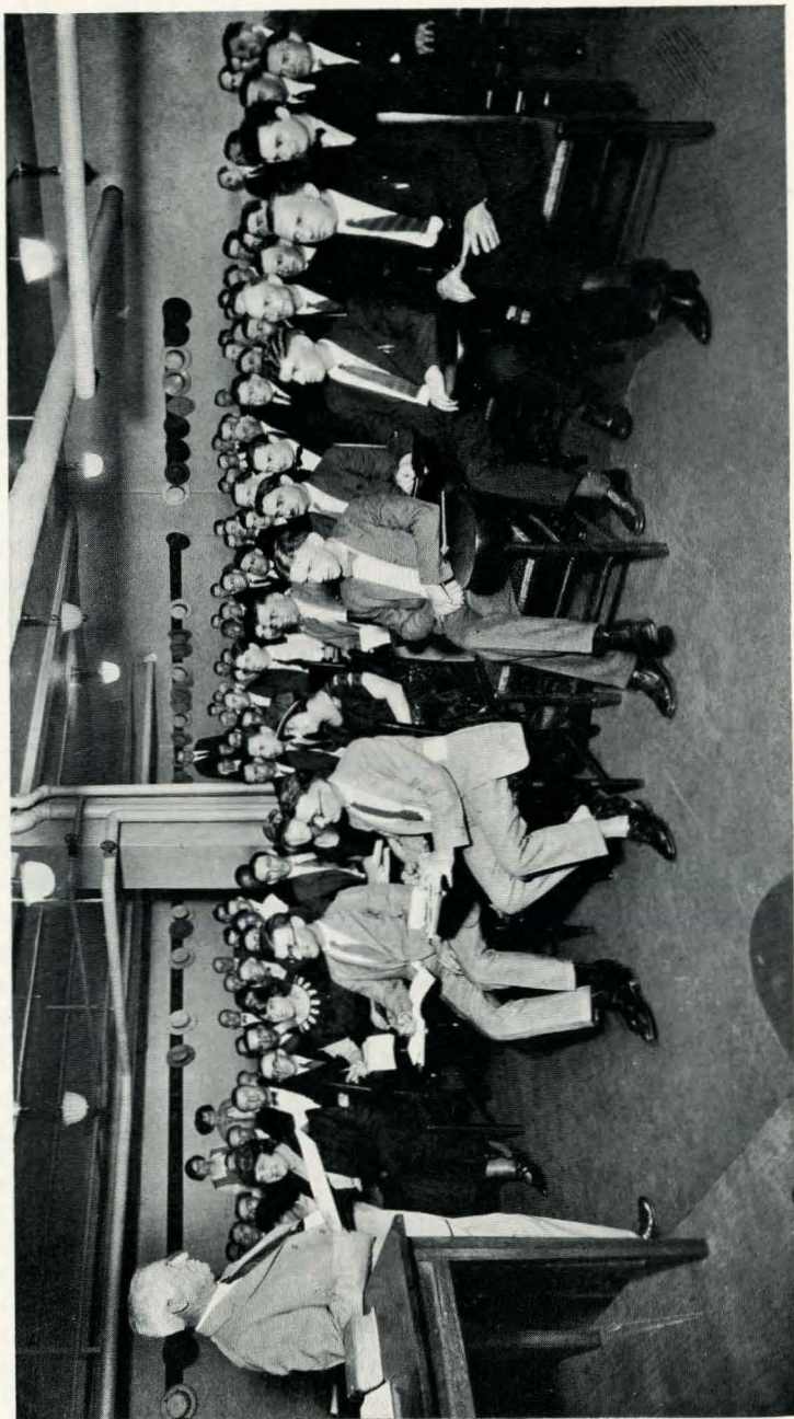
CLASS OF '25