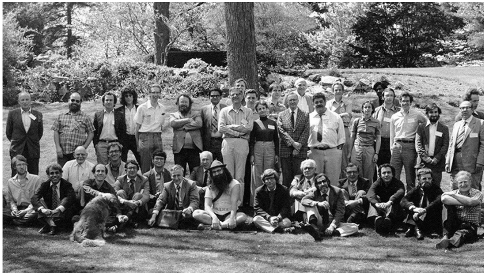
Figure 2: Attendees of the 1981 Physics of Computation conference “Celebrating the 40-year anniversary of the Physics of Computation Conference” 2021