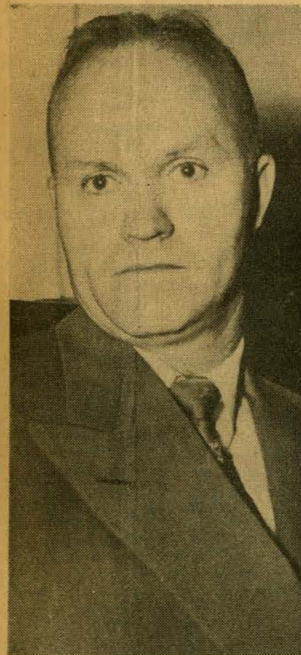
"Why would an innocent man refuse the test?"