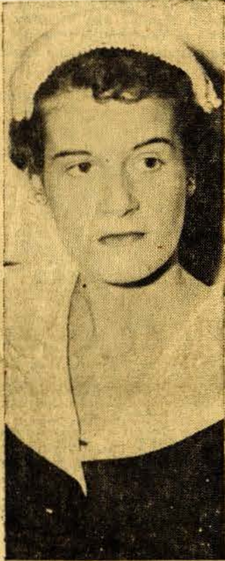
Star witness will be Susan Hayes, 24, who admits intimacies with Dr. Sam.