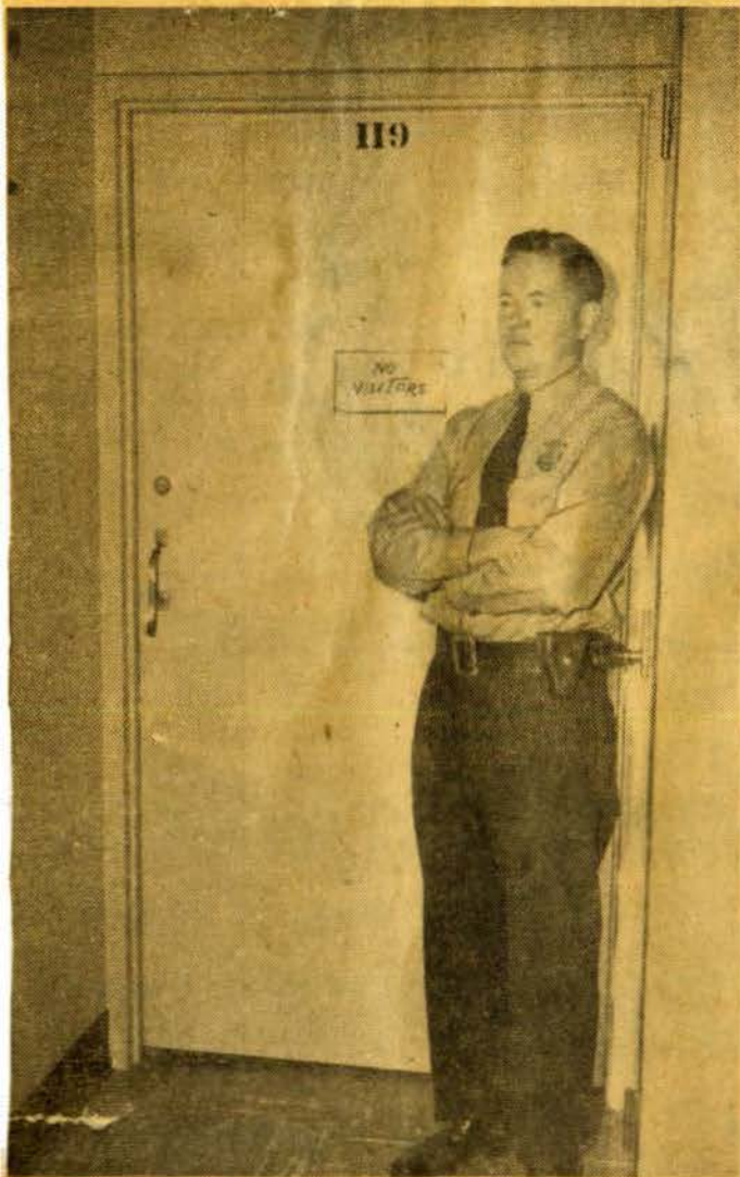
Patrolman Gerhard H. Deutschlander stands guard at door to room occupied by Dr. Samuel H. Shepard in Bay View Hospital.