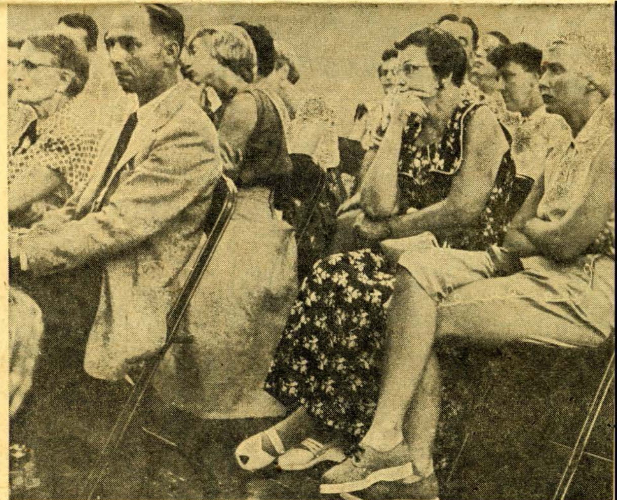
CROWD. Spectators listen intently as Dr. Samuel Sheppard relates events the night his wife