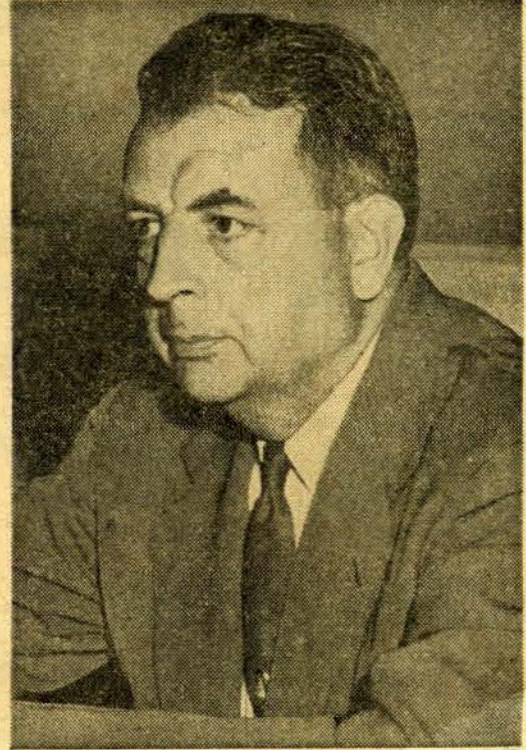
BAY VILLAGE MAYOR J. SPENCER HO