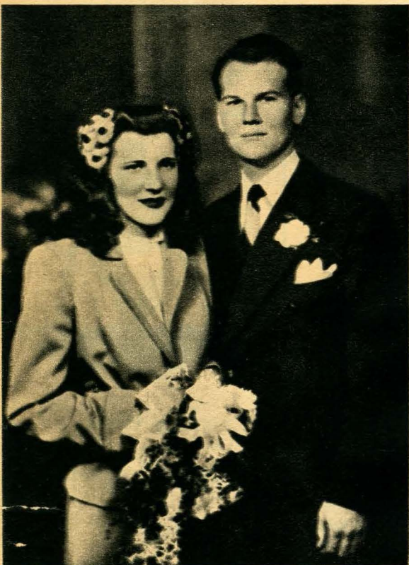
When Sam Sheppard and Marilyn Reese were married in 1945 they moved into a furnished house and Sam's mother stayed awhile to teach the bride to cook.

enjoy sex to the same degree. Nevertheless she longed for their marriage to last. "I can only pray that somehow things will right themselves—after all, because of me he never had the chance to date lots of girls in school like other boys," she would say sadly.