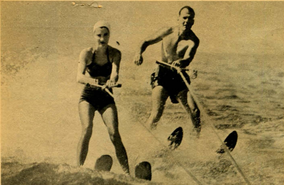
In the summer of 1952 the Sheppards were the most enthusiastic water-skiers in the community of Bay Village. Dr. Sam, who kept in tip-top physical condition, enjoyed teaching the teen-agers of the neighborhood to ride the waves of Lake Erie.