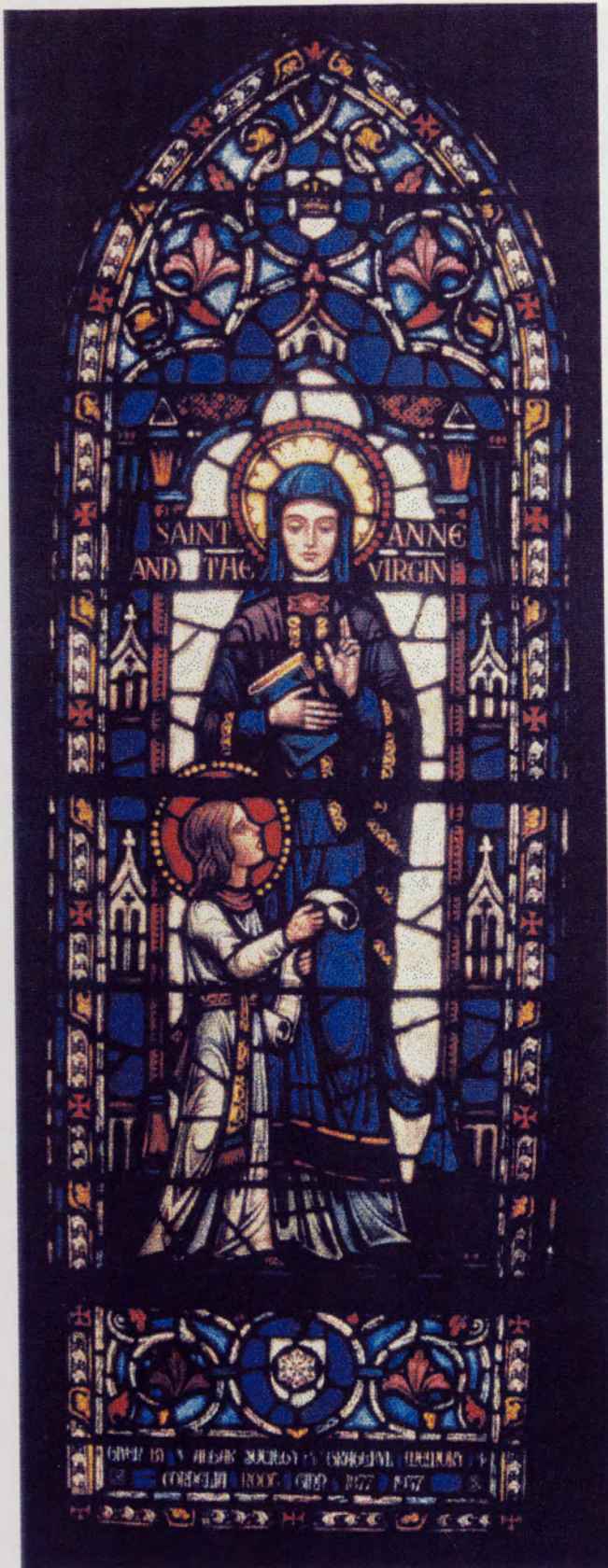
Plate 1 Saint Anne and the Virgin