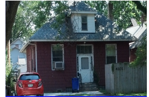
B'nai Israel West Side Jewish Center 4101 John Avenue. 1940 -1953