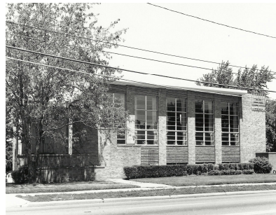
Beth Israel - The West Side Temple 14308 Triskett Road 1953 - Current

Clipping from the Cleveland Plain Dealer December 2, 1882. No Other supportive material found.