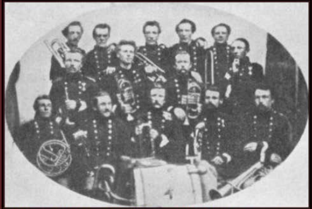
R) Liniebataljons Musikkorps ("Kjøbenhavnernes") Garrison in Rendsborg Germany, 1852-1863. Photo taken 1863.