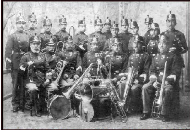
L) Regiments Musikkorps, Aarhus, photo ca. 1890.