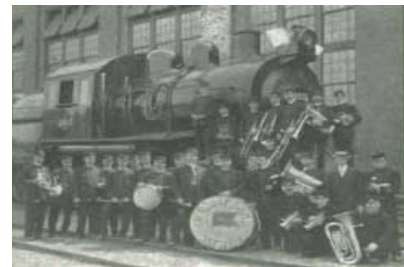
Sayre Shop Band / The Lehigh Valley Railroad, 1908 The Daily Railroad Age Gazette

This chapter will introduce a small sample of wind-bands that have contributed to the genre, both past and present. All of these groups, regardless of nationality, universal popularity or name recognition have conventional ties and pursue common goals. It is this thread that has maintained the wind-band culture and philosophy throughout its history. These examples are a reflection of the present being linked to the